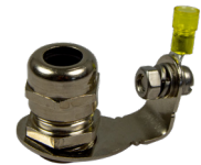
EH-FP-BOX-16-EMV Cable gland for EMC connection TKZ: 80814