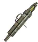
EH-FP-10601-79°C Thermal actuator for box-type generators TKZ: 40338