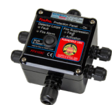
EH-FPX-103C Fire control panel for detection / activation TKZ: 80680