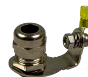
EH-FP-BOX-16-EMV Cable gland for EMC connection TKZ: 80814