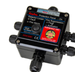
EH-FPX-103C Fire control panel for detection / activation TKZ: 80680