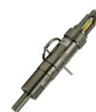
EH-FP-10601-79°C Thermal actuator for box-type generators TKZ: 40338